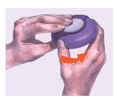
1. Open - How to use the Accuhaler/Diskus. To open your Accuhaler/Diskus, hold the outer case in one hand and put the thumb of your other hand on the thumbgrip. Push your thumb away from you as far as it will go.

Sliding the lever of your Accuhaler/Diskus opens a small hole in the mouthpiece and unwraps a dose, ready for you to inhale it. When you close the Accuhaler/Diskus, the lever automatically moves back to its original position, ready for your next dose when you need it. The outer case protects your Accuhaler/Diskus when it is not in use.